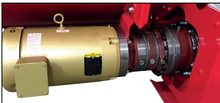
PLANETARY AND MOTORIZATION