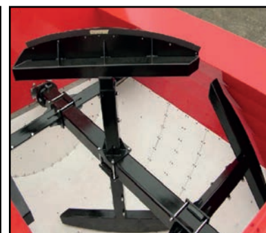
TUB - PADDLE & LINER